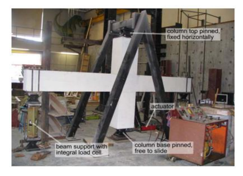
Figure 3 Test setup

Instrumentation introduced on the test units permitted generally speaking removals of the sub-gathering to be checked and furthermore permitted flexural and shear distortions of the pillars, sections and joint center to be determined. The test units were exposed to float controlled cyclic stacking, and testing was proceeded until it was unreasonable to continue further because of crumbling of the test units.